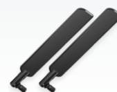
HGO indoor antenna kit